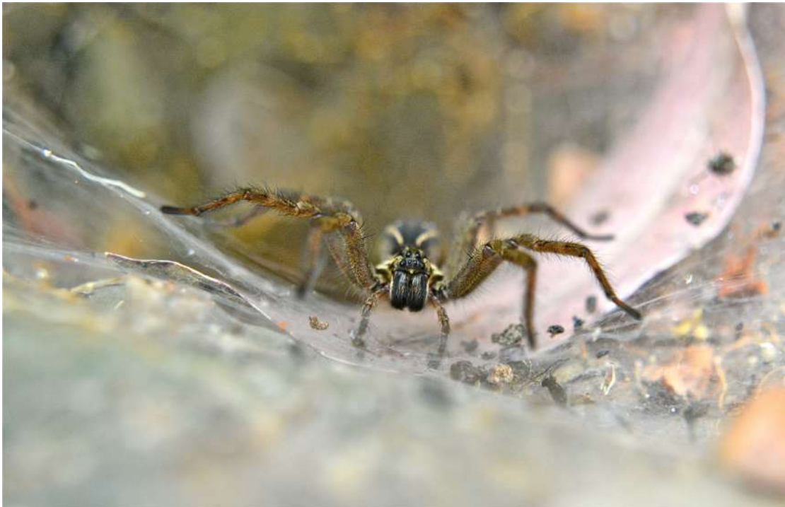
Aglaoctenus lagotis

After the session finishes, we will ask presenters to remove their posters because we will be having new poster presentations on the following day.