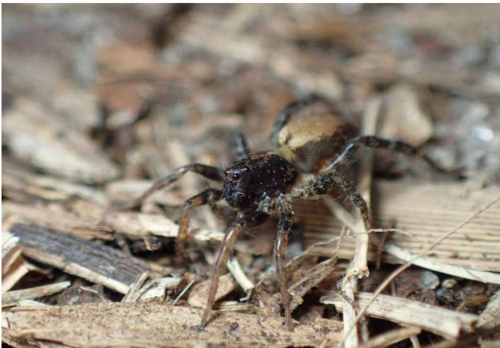
Abaycosa nanica