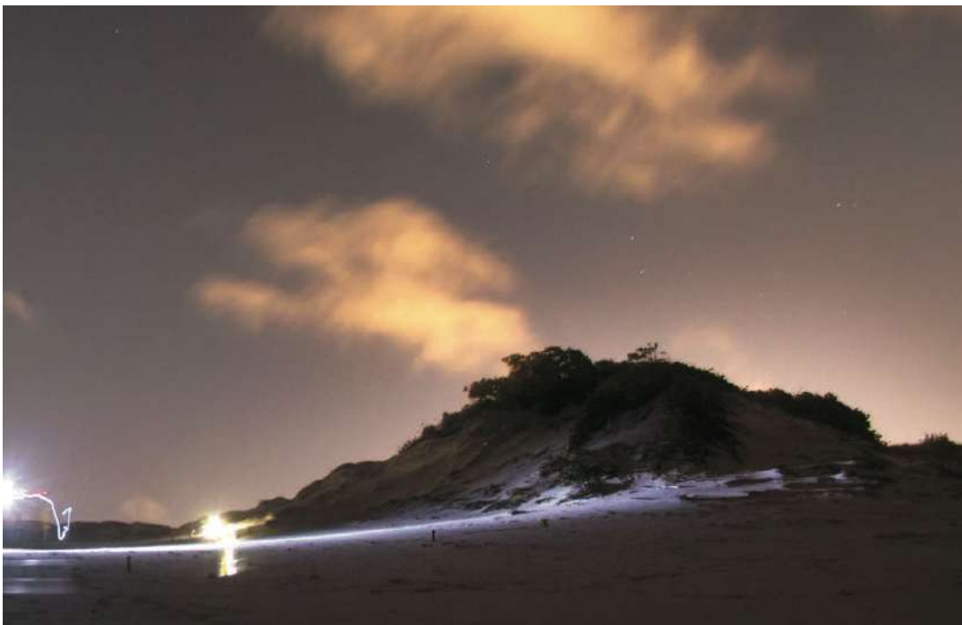
Field sampling at Salvador de Bahia, Brazil

https://docs.google.com/forms/d/e/1FAIpQLScY68vjZ9Gx0jvI3rmT8FBN3drYS6ksHv7tdMDPcL9EPTGr_A/viewform